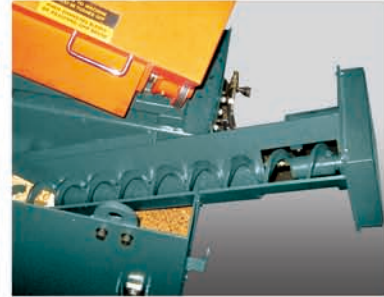
Variable speed hydraulic chip auger