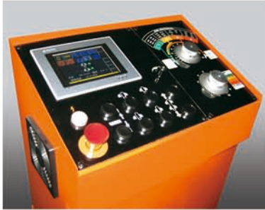
Ergonomic control console & 5.7" touch panel

C-260NC is a high-standard bandsaw machine designed specifically for mass production. Featuring ductile cast iron vises, chrome plated feeding shaft, precision-ground heat-treated worm shafts, rub-free hardened wear plates, shaftless hydraulic motor driven chip auger, 5.7" touch panel, SNC-100 program control, and last but not least, precision feed pressure and feed rate dual valve system, C-260NC is an extremely powerful high performance bandsaw for your mass production needs.