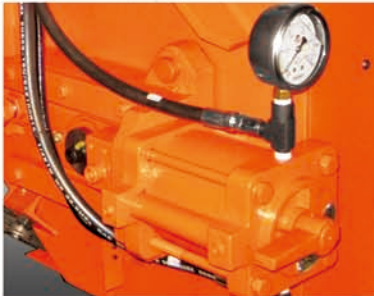
Hydraulic tension cylinder with built-in on/off valve