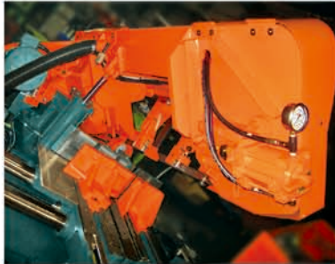
A sturdily built saw bow