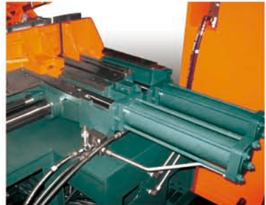
Full stroke hydraulic cylinder